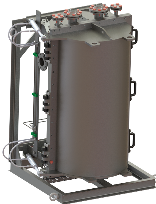
Enclosed Gas Valve Unit HON E-GVU